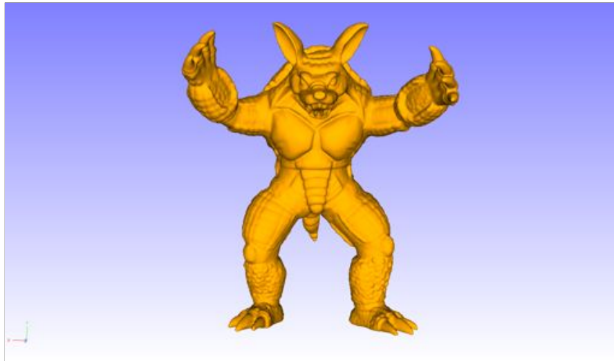
Figure 2. Armadillo.